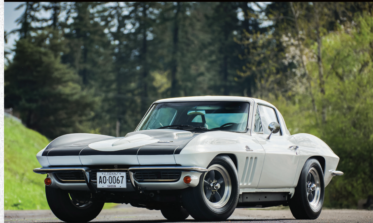
To be offered at Glendale 2023 1966 CHEVROLET CORVETTE BIG TANK COUPE • 427/425 HP, 1 of 15 with M22 4-Speed